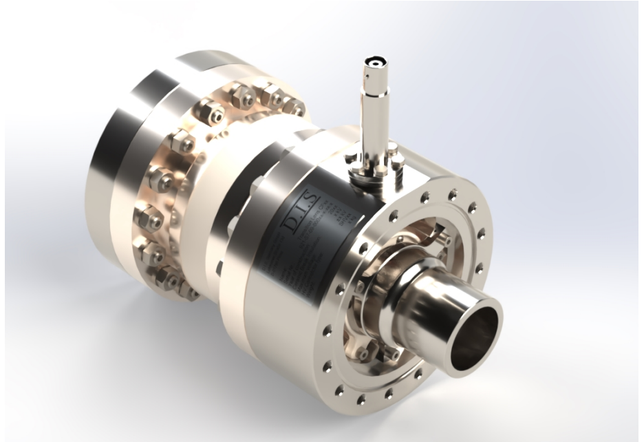
Transition Lens CF100, 20kV Insulation .

Transition lenses can be used in broad pressure ranges, down to ultra-high vacuum conditions.