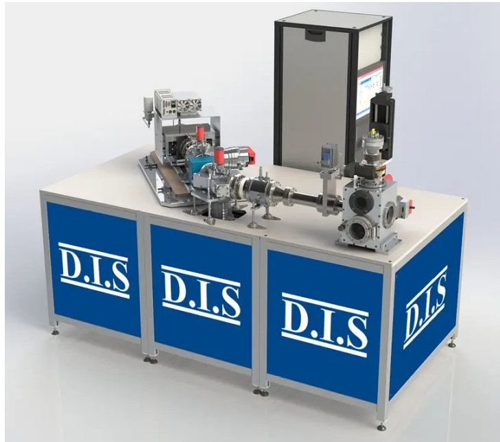
Ion Irradiation Facility, Type-M + Irradiation Chamber Setup. The electrical shielding is masked out.

All components are highly modularized and can be offered separately.